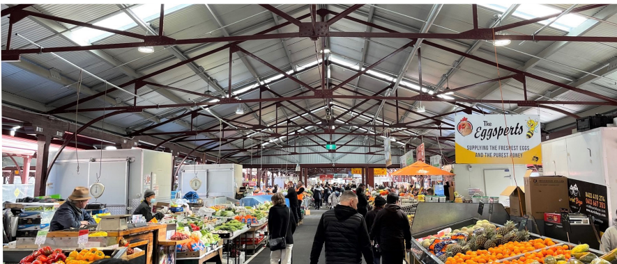
Photo: Recently restored Shed B

We're onto the final stage of the $30 million restoration of the market's iconic open-air sheds.