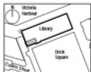
Location Second Floor