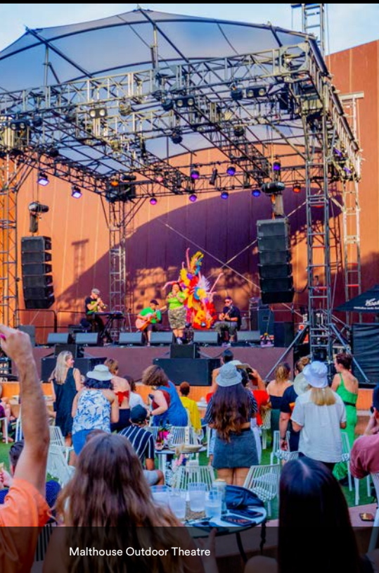
Malthouse Outdoor Theatre