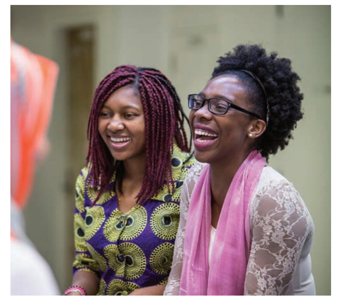
Image caption: Social Sustainability – people experiencing social or economic exclusion or disadvantage