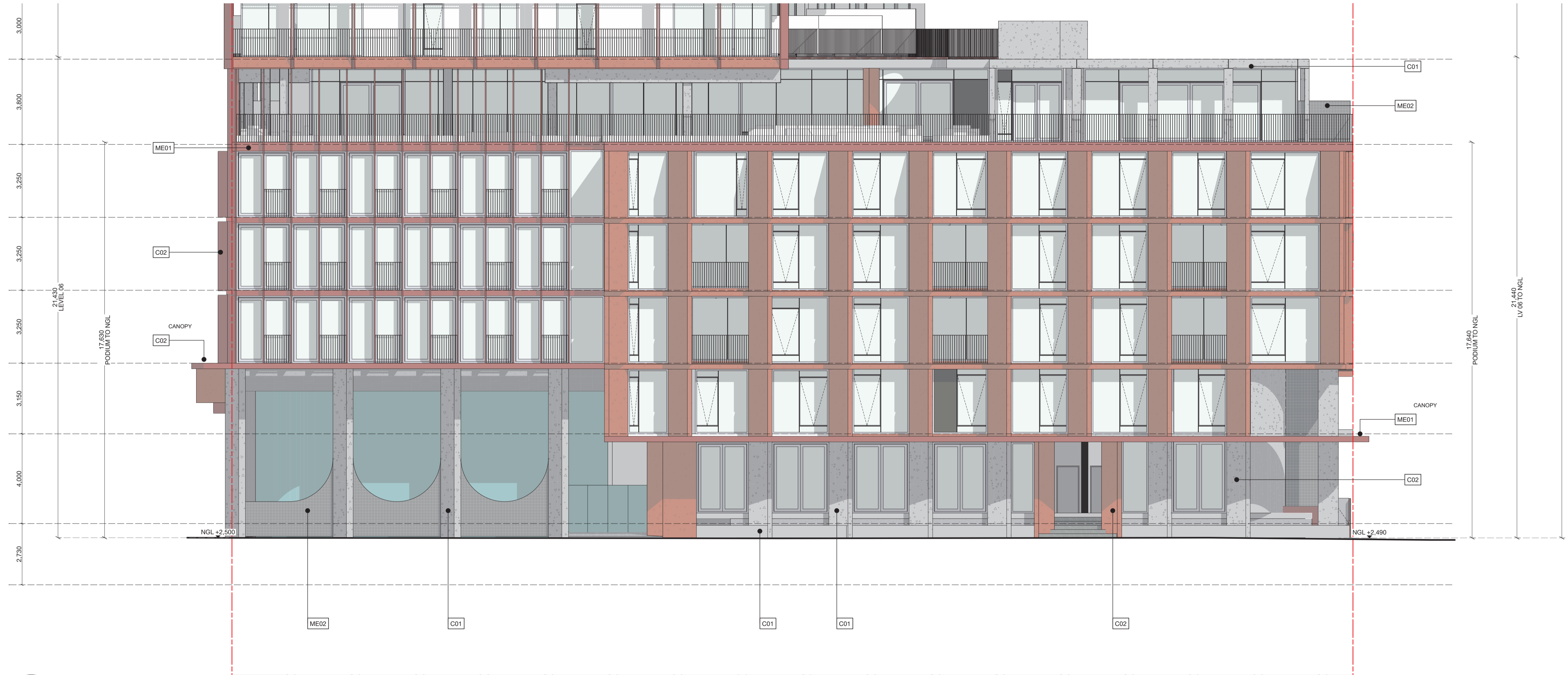
E-08 NORTH ELEVATION SCALE 1:100 @ A1 SCALE 1:200 @ A3